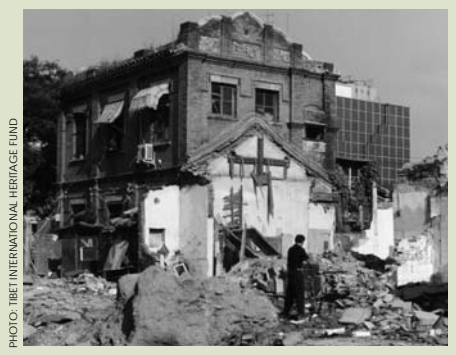
beautiful neighbourhoods and proud parts of the city.

Informal settlements provide a much-needed stock of affordable housing for the people whose hard work is fueling the city's economic growth. Enabling these communities to stay where they already are constitutes a reasonable use of publicly-owned land. When people are given secure tenure and a little support, they can transform their settlements into